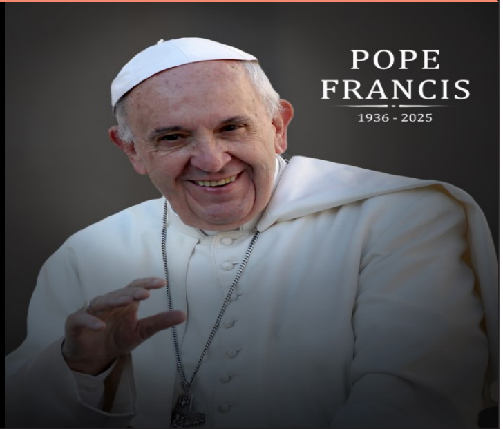
POPE FRANCIS 1936 - 2025