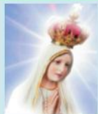
Our Lady of Fatima