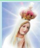
Our Lady of Fatima