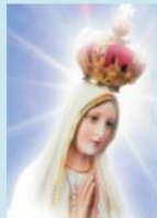
Our Lady of Fatima